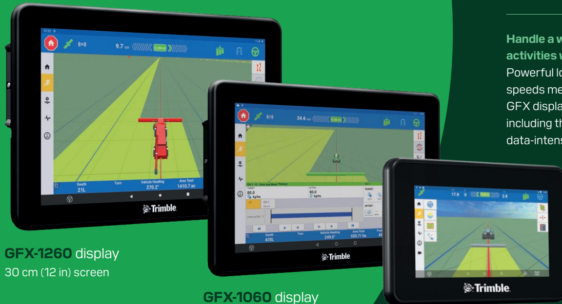
GFX-1260 display 30 cm (12 in) screen

GFX displays easily scale and adapt so you can make hassle-free updates to your screen size, positioning and steering systems, or expanded implement needs.